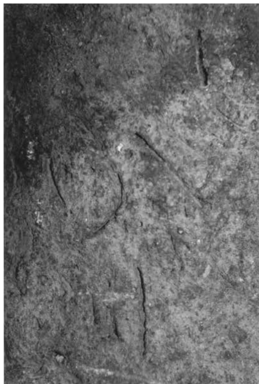
Figure 6. Close-up photograph of the surface of the pot showing vugs, which are evidence of probable vegetal temper.

occurrence of fired clay vessels similar to Farmer's pot (see e.g., Kroeber 1925:Plate 51; Gayton 1929:Plates 99–102; Steward 1933:Figure 1a–i, Plate 5 a, b, d; Underhill 1941:35; Lathrap and Meighan 1951:Plate 3a; Berryman and Elsasser 1966:Figure 8; Elsasser 1972:21; Smith 1978:443; Wallace and Wallace 1979:19–22; Liljeblad and Fowler 1986:421–422; Madsen 1986:Figure 6; Jackson 1990; Wallace 1990).