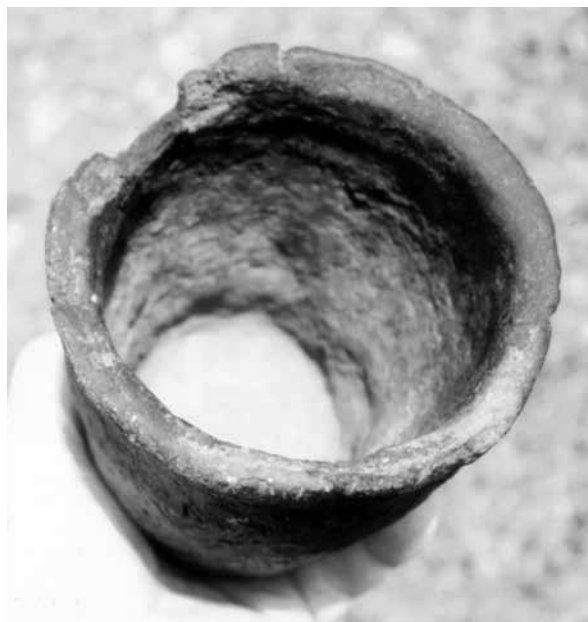
Figure 5. Interior view of the pot.