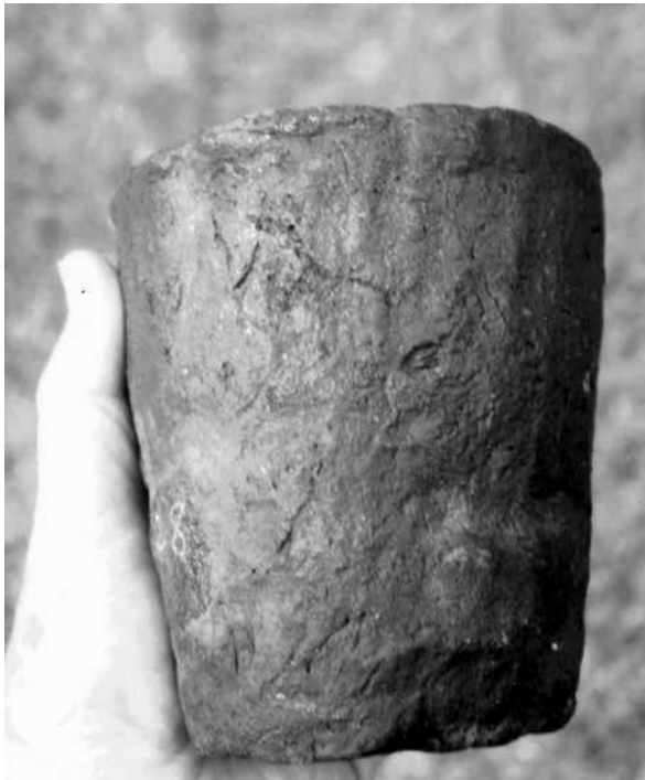
Figure 3. Another view of Malcolm Farmer's ceramic pot.