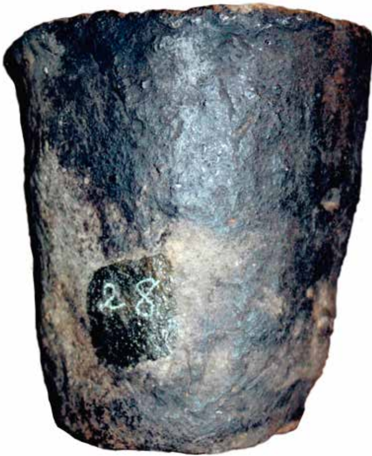
Figure 1. Ceramic pot from the estate of Malcolm Farmer. Maximum height of specimen is 127 mm.