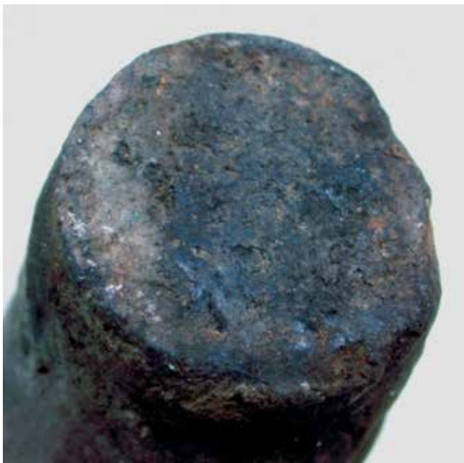
Figure 2. Bottom of the pot.