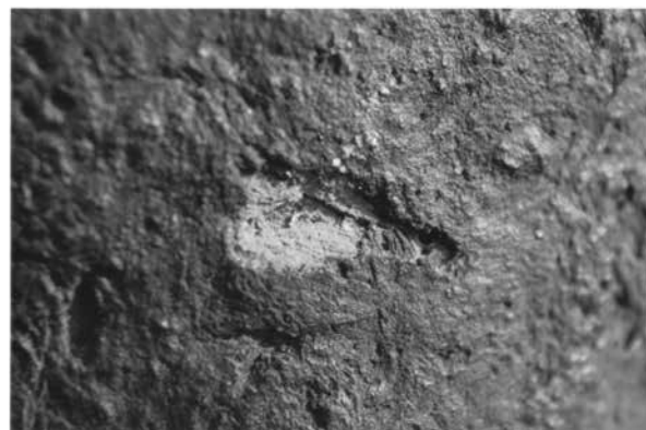
Figure 8. Small chip missing from asphalted surface reveals that the pot's paste was light colored and therefore not impregnated with asphaltum.

Sufficiently fired pots were removed from the fire while at high heat and were immediately