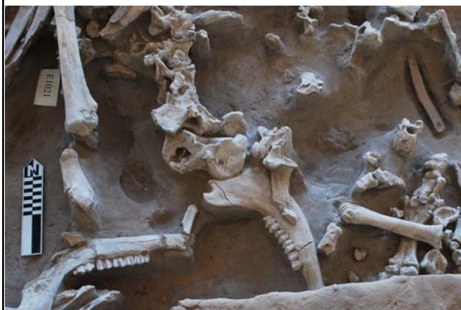
Bone bed at Blackwater Draw.

Come to the April 11th meeting and learn about current research at the Clovis site at Blackwater Draw.