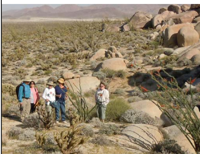
March Field Trip to Anza-Borrego Desert State Park.