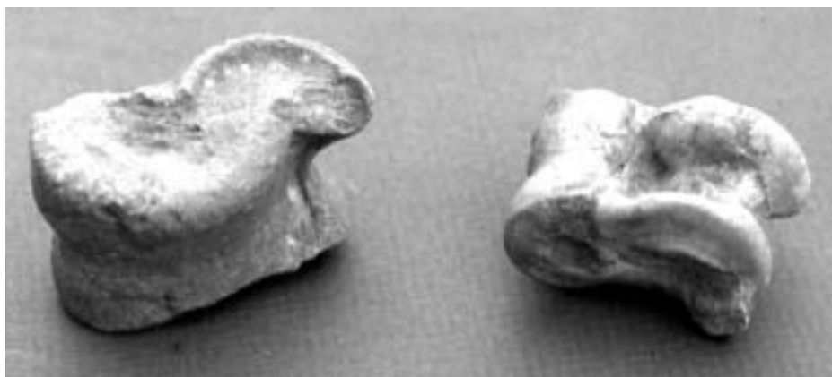
Fig. 3. Astragalus bones from CA-ORA-83: 3a is on the left.

The deer astragalus (Fig.1) collected by Herrold Plante from the Bolsa Chica area is an artifact rather than an ecofactual item. It clearly shows some use wear. Two other specimens exhibit some wear (Fig. 3).