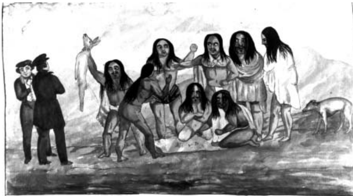
Fig. 2. Nineteenth century watercolor sketch of California Indians gambling by Gunner William H. Meyers.

Luiseño (Drucker 1937:24). Gunner Meyers' last century watercolor sketch (Fig. 2) shows California Indians gambling with what appear to be astragalus bones (see also Camp 1966:illustration opposite title page).